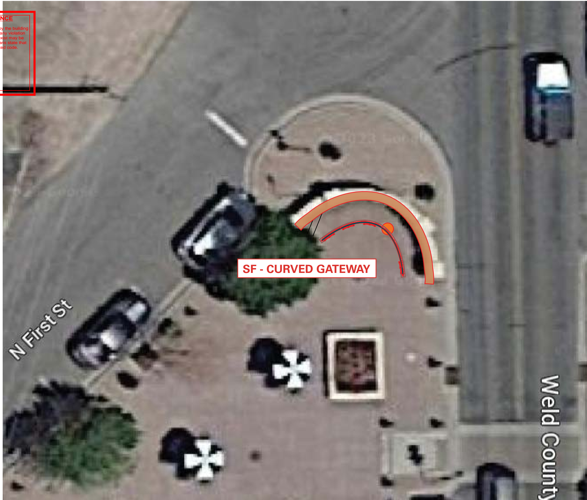
Curved Gateway - SITE PLAN